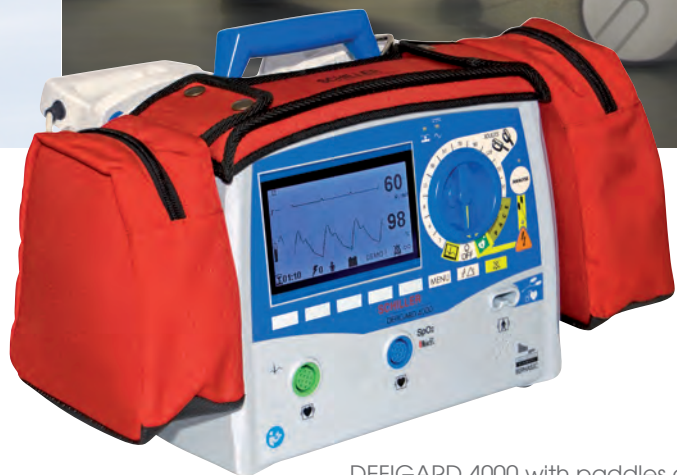
DEFIGARD 4000 with paddles and pockets

The device can easily be removed from the mounting.