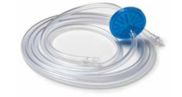
Daily Use Endo SmartCap® CO, Source Tubing

• Minimizes patient discomfort associated with bloating and cramping from room air.1