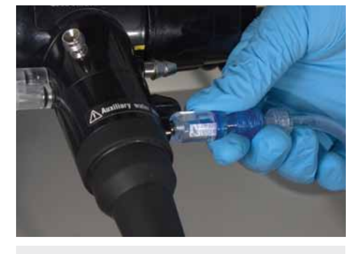
Auxiliary Water Jet Connection